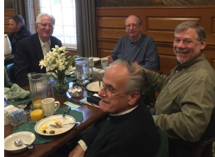
Silent Retreat at Bellermine House with Our Lady of the Grove Knights and St. Mary Men's Club members